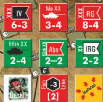
98 counters and markers